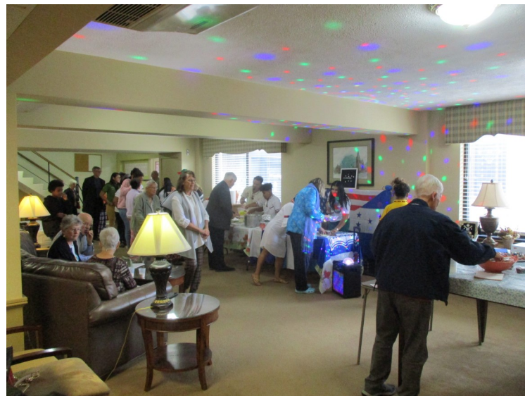
Open House for Hispanic Heritage Month